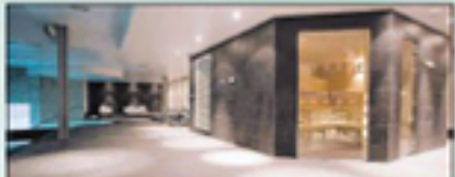
MAKE A SPLASH: The wet area at the DoubleTree by Hilton Hotel in Hooke, Chester, includes a jacuzzi, swimming pool, sauna and lounge room.

The spa at DoubleTree by Hilton Chester isn't just somewhere to stretch and relax after the stresses of 2011, it's a fantastic space for couples who want to share some quality time together. It's just right for you in the good books too.