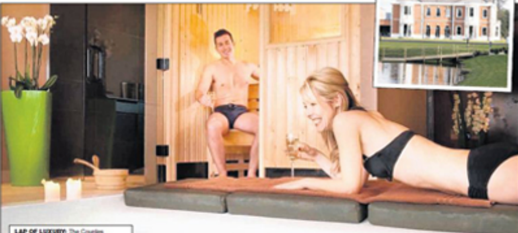
LAP OF LUXURY: The Couple Treatment Room at the DoubleTree by Hilton Chester. I see for a longer day of Valentine's Day and it's sensory my other last will arrange a slip up next, flowers and gifts, this day year is my time for a change.